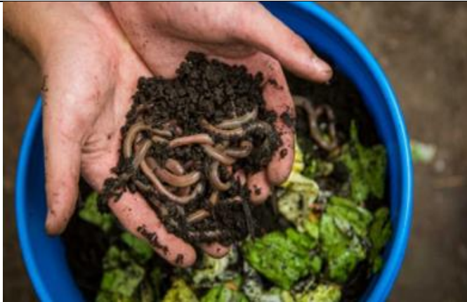
VERMICOMPOST – GARDENING WITH WORMS