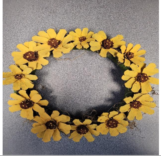
MAKE YOUR OWN PINE CONE WREATH