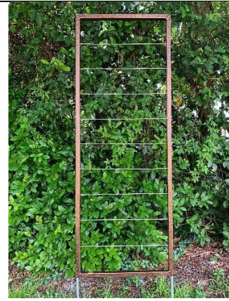
BUILD YOUR GARDEN TRELLIS