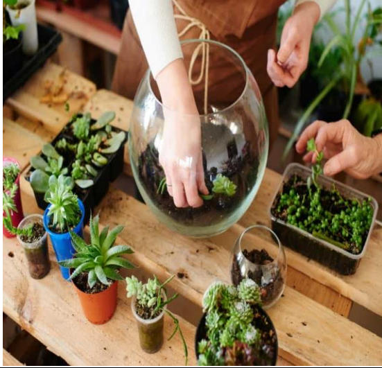
BUILD YOUR OWN TERRARIUM