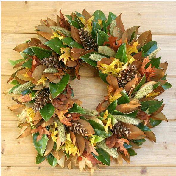
MAKE A MAGNOLIA LEAF WREATH